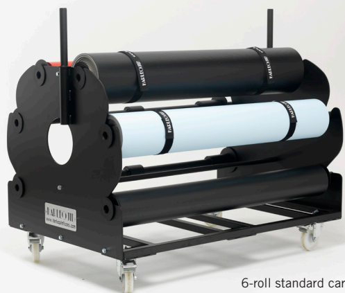
6-roll standard cart