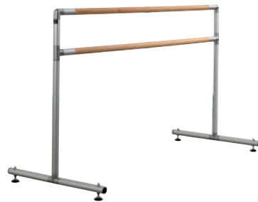
Medium • length of barre 182cm (71.65") • weight (approx.) 12kg