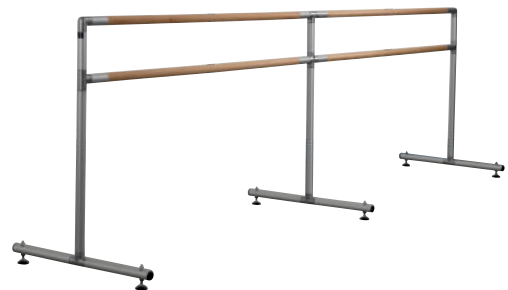
Large • length of barre 360cm (141.73") • weight (approx.) 20kg