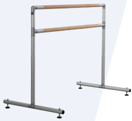
Small • length of barre 132cm (51.97") • weight (approx.) 9kg