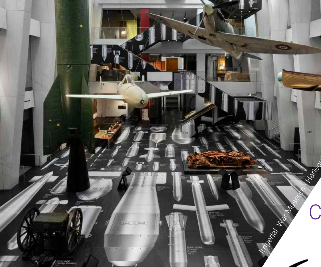
Imperial War Museum - Harlequin Clarity Printed