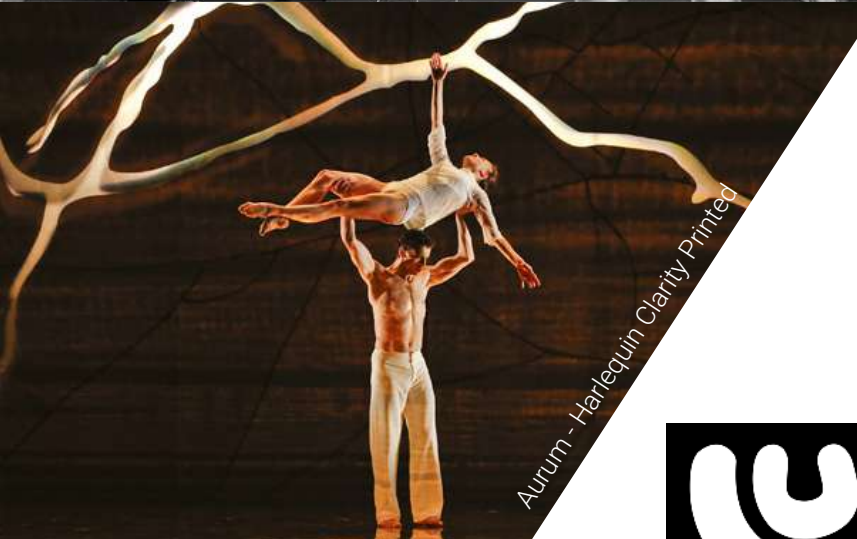
Aurum - Harlequin Clarity Printed