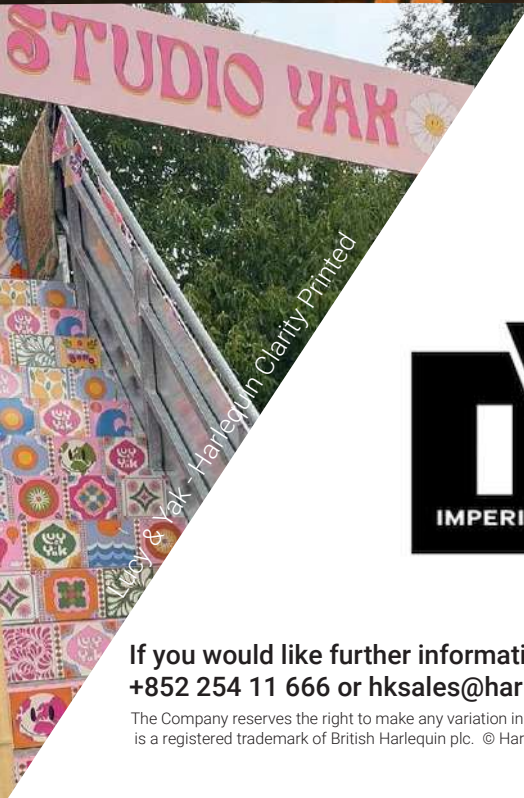
Yak & Yak - Harlequin Clarity Printed