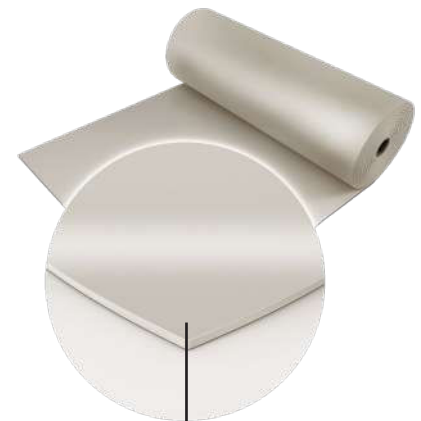
Homogeneous vinyl with support and a slip-resistant dance surface