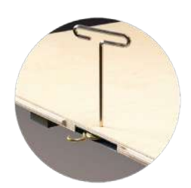
Harlequin's 'latch and lock' system