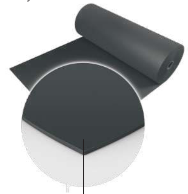
Homogeneous vinyl with a slip-resistant performance surface