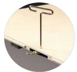
Harlequin's 'latch and lock' system